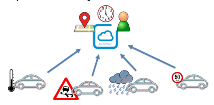
Figure 1 Providing cloud services by accessing valuable vehicle data.

Providing novel IoT and Big Data services are considered as high business potential. Many of these services rely on accessing and collecting valuable data that is embedded in different Electronic Control Units (ECUs) (see Figure 1). However, today this data is deeply buried in the OEM specific E/E architecture. Since in-vehicle communication is statically configured, necessary adjustments would lead to the requirement of re-flashing relevant ECUs.