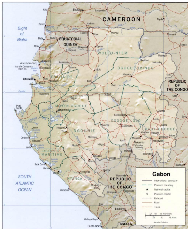
Figure 2: Map of Gabon [66].