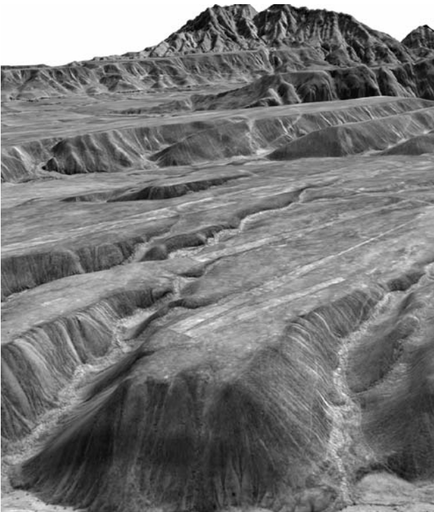
Fig. 3. Virtual view over Pampa de San Ignacio towards Cresta de Sacramento generated using ERDAS Imaging Virtual GIS 8.4.

Moving beyond the situation in Palpa, aerial photogrammetry has proven a powerful tool to efficiently document large sites in arid environments. In the desert on the Peruvian coast, many hitherto unrecorded prehispanic sites are nowadays in imminent danger of being destroyed by modern land use. Modern aerial photogrammetry can help to prevent the loss of these sites.