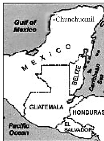
Fig. 1. Map of the Maya region showing the location of Chunchucmil.

At its maximum extent, the site may have covered an area of at least 25 km 2 , as indicated by aerial photos and satellite imagery. At this time the city achieved one of the highest structural densities in the Maya area and we conservatively estimate that 34,000 to 39,000 people were living here