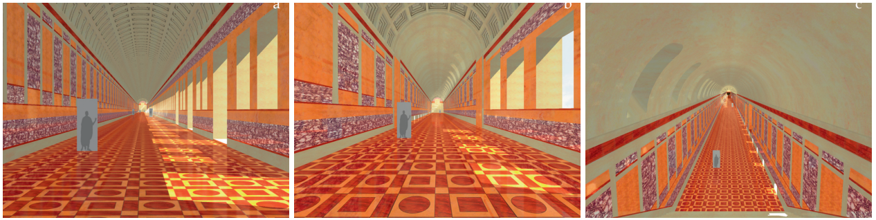
Fig. 1. 3D reconstruction results of the cryptoporticus.