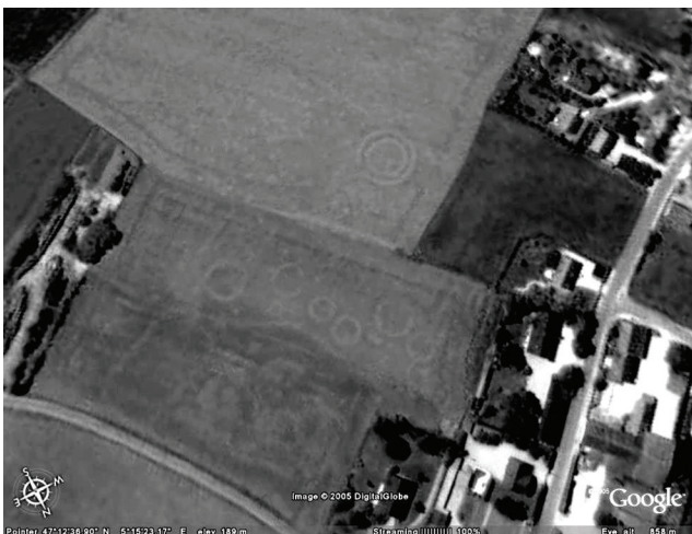
Figure 8. A group of nine round features that closely resemble Iron Age tumuli. There is also a large rectangular feature associated.

that visually enhanced the images for interpretation. In all, a surprisingly large number of definite archaeological features or groups of features were identified in this quick, visual analysis of the image: five major road segments and several smaller ones, eight possible quarry sites, and other possible features. Each of these features was marked with a placemark, and relevant information such as size, orientation, and distance from nearby landmarks was recorded using the Google Earth tools.