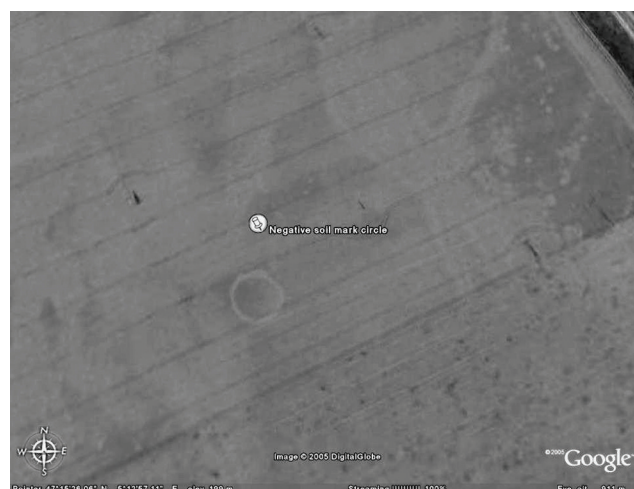
Figure 2. A circular soil mark measuring some 30 m across in association with a Roman road (at left). The black features are electrical power lines.

An example of the potential use of the integrated Google Earth data was that a small village lies a few kilometers to the south of this roadway. When the “Roads” icon at the bottom of the Google Earth screen was turned on, it showed a vector GIS roads overlay, which includes the names of each road. A modern road section connected up on a straight line with the linear feature I identified. This road was labeled “Impasse de la Voie Romaine” or “dead end of the Roman Road,” a clear indication that the section of this road was indeed an old Roman roadway (Figure 3). This example clearly shows the utility of the Google Earth environment for this type of analysis. It was very useful to mark the road location with several placemarks to give the orientation of