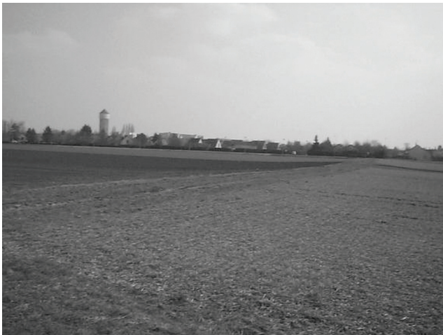
Figure 4. A ground view of the Roman roadway, running diagonally across the picture from bottom left to top right. The road was clearly visible as a raised, straight roadway.