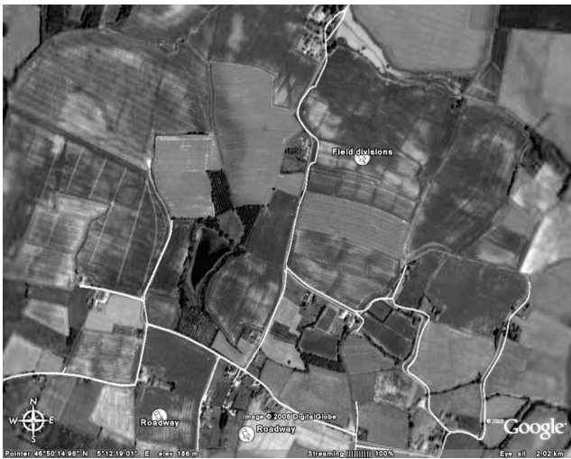
Figure 7. An area of “Celtic Field” divisions. A very large area of these, covering several square kilometers, was located. The field divisions show as a series of regularly spaced dark lines that cross modern field boundaries.