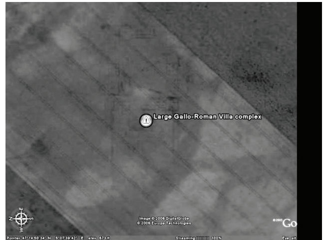
Figure 9. A large Gallo-Roman villa complex, measuring some 80 by 180 m.

Field verification was conducted in March, 2006. A visit was made to the Ministry of Culture, Service Archeologique du Bourgogne in Dijon to determine if these sites were already recorded in the national French archaeological database. The area is well known archaeologically, and had been previously flown extensively by aerial archaeologist Renée Goguet. The Gallo-Roman era road was known, as was the circular feature in association with it. Portions of the positive crop marks (Figure 1) and some of the nine round tumuli