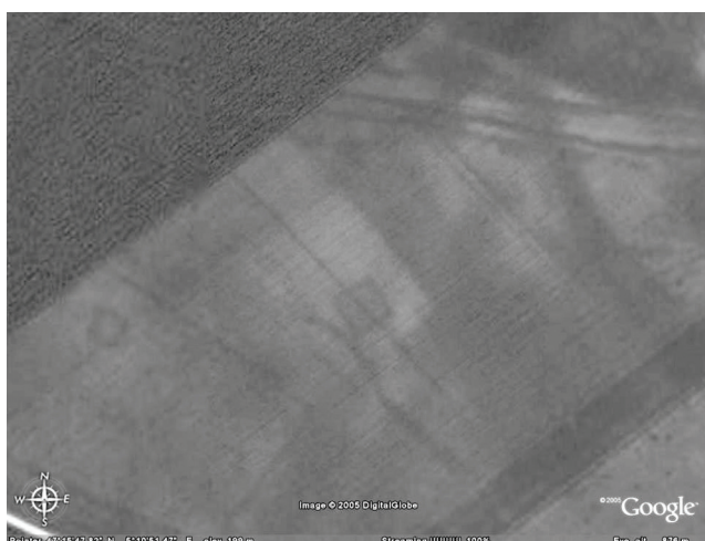
Figure 1. Two square positive crop marks that are also in association with an intersection of an old roadway and other linear features.

In the course of this analysis, I was able to locate a surprising number of definite archaeological sites. This area of Burgundy is not my regular research area, which, alas, does not have Google Earth 0.7 m coverage available at the