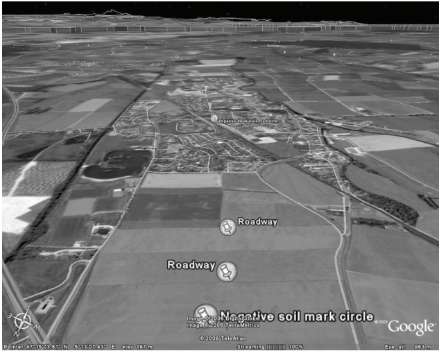
Figure 3. A perspective view of the Roman Road. The circular feature is at bottom, just above the push pin. The modern “Impasse de la Voie Romaine” is shown at top center, in line with the ancient road below.