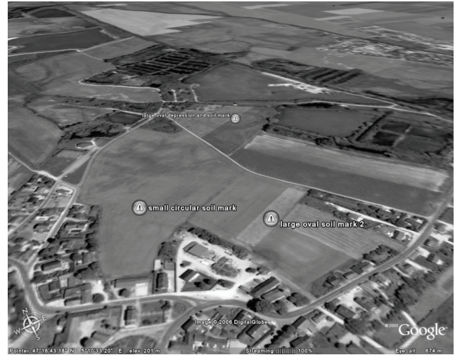
Figure 5. A group of three, large, circular features. Each appears to be a raised feature surrounded by a lower area. The largest feature is at the top.