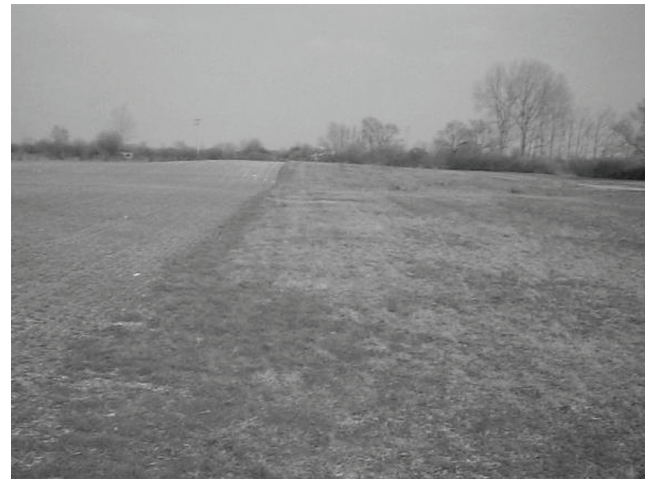
Figure 6. The largest of the round features in Figure 5, shown from the ground. The raised area is clearly visible at top, as is the darkened lower area surrounding it. This area has enhanced vegetation due to water retention. A significant amount of medieval ceramics were scattered throughout the feature.

the road. I then used the 3D perspective view to look along the known road segment and to move forward along that line to see if I could see any additional vestiges (Figure 3). In several cases, this technique worked, and I was able to locate additional road segments and to “connect the dots” of multiple road segments in the image. This area is also shown in a ground image (Figure 4). The road was clearly visible on the ground as a raised, straight roadway.