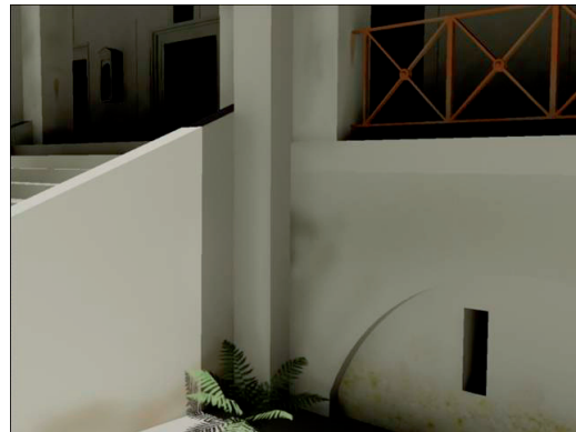
Fig. 3. Spot the difference: Many aspects of this view are still under discussio.