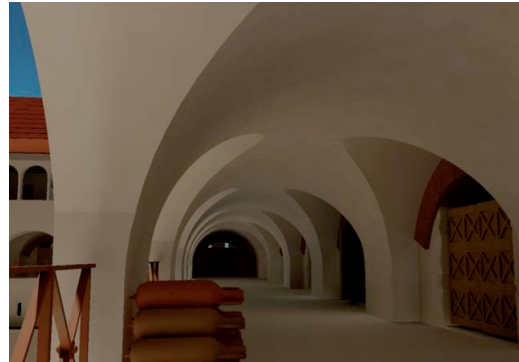
Fig. 1. A view of the exterior of the virtual Grandi Magazzini di Settimio Severo after many long discussions, (author's own).

The representation of uncertainty is and always has been something of a dilemma for all archaeologists. Verbally, textually and visually archaeologists have had to develop means of expressing and incorporating uncertainty and ambiguity into the archaeological process and into their representations of archaeology. Expressions of uncertainty regarding archaeological interpretation and indeed statements regarding the nature of the understanding that an archaeologist can claim to hold have dominated theoretical