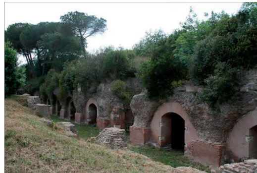
Fig. 2. A view of the exterior of the Grandi Magazzini Di Settimio Severo after many years.