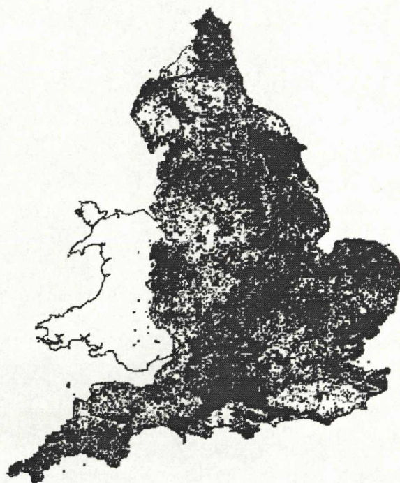
Figure 1 Distribution of aerial photographs in England 1996.

1960) and by others (Bewley 1984a and b, Palmer 1984, Whimster 1989) in the early 1980s.