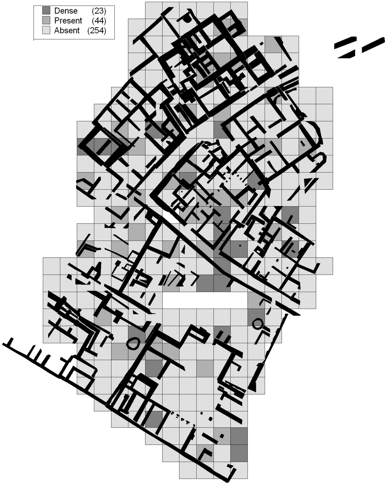
Figure 2. Ranged mapping of the artifact counts.