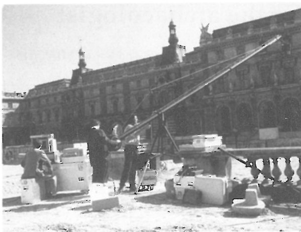
Figure 8.1: The Arkéoplan system in the field with the tripod and its seven meter long pole to hold the camera.