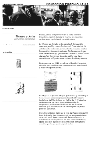
Figure 4 Itineraries: the exile