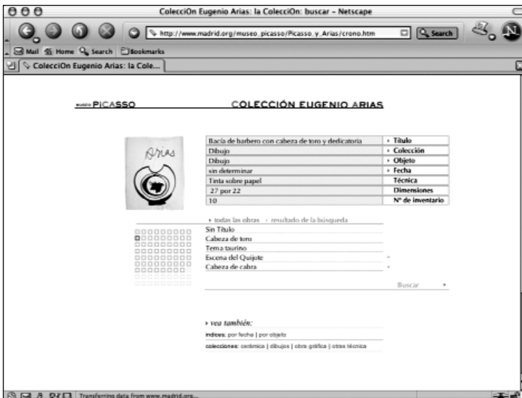
Figure 6 The collection browser