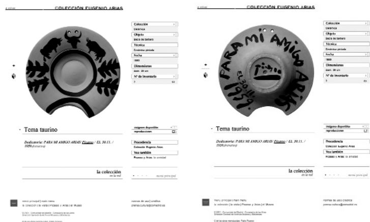
Figure 1 and 2 The digital library: a record

The Web site's "digital exhibit design" is just a few clicks away from the greatest centres of art around the globe, and this is why the anecdotal aspect of