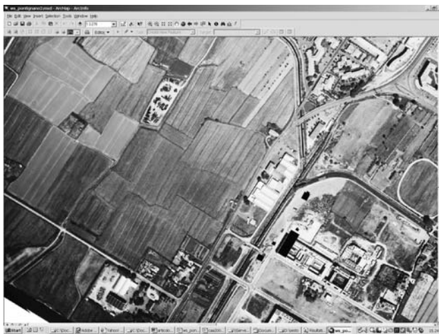
Fig. 2. A detail of IR aerial photo focuses on the Lastruccia site (black areas).

Even though it is not possible to analyze the absolute values (DN) of the individual pixels as in a satellite imaging system, however, in performing an RGB scanning analysis, and when