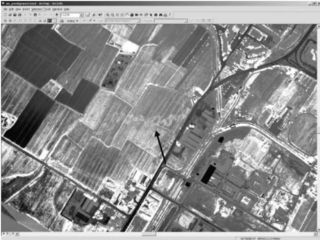
Fig. 3. The NDVI elaboration highlights the small palaeo-river (pale grey) in the proximity of Lastruccia site (black areas).

establishment of a community is quite compelling. We may surmise that during the third millennium water streams were considered an important economic resource of the landscape and, by the same token, the bed of a temporary or palaeo river constituted an advantageous location to exploit, at minimal human cost and energy, for the purpose of settlement in a wetland area. With this in mind, we have considered it our utmost objective to gather all minutiae available to us with which to construct a comprehensive palaeo environmental framework. The analysis of the aerial photographs as well as the geomorphological features shows that large palaeo rivers crossed the Lastruccia area, thus confirming the data brought to light by archaeological excavations (Martini et alii 1999). Our study of infrared aerial photos and of the particulars revealed by our application of the NDVI further corroborates the presence of vegetation intensity corresponding to the palaeo river zones (on those parts of land not actually covered by recent buildings), and it also shows, within an area corresponding to open fields the existence of a small very sinuous feature with an extremely high concentration of vegetation.