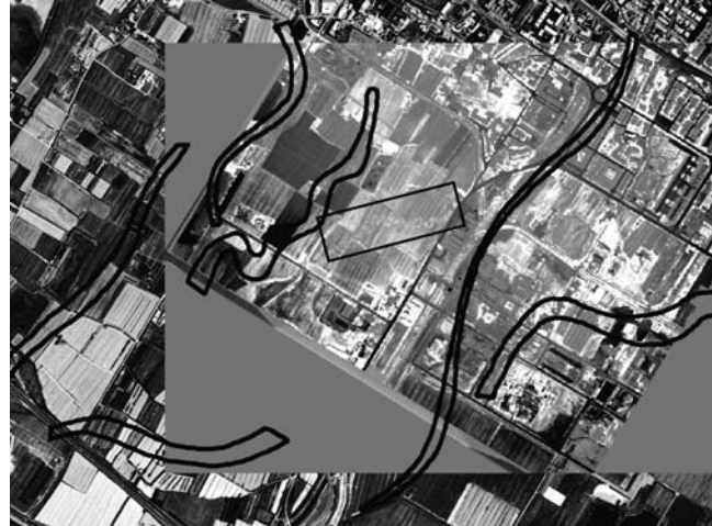
Fig. 4. The palaeo-rivers (sinuous black lines) and the feature (inside the black rectangle) individuated through NDVI, within the territory.

Whatever the exact nature of the sinuous palaeo-river, it is still important to integrate it within the geographical framework. By changing the zoom level, and by examining the Sesto Fiorentino territory within the landscape of the Florence-Prato-Pistoia plain in its entirety, it has come to our attention that the direction and orientation of the hypothetical