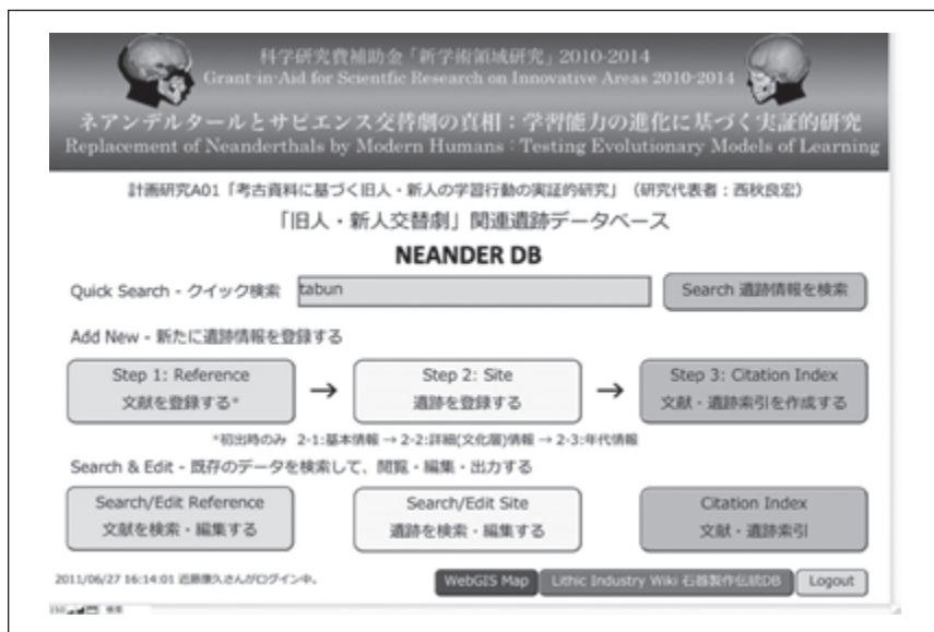
Figure 3. Portal interface of the Neander DB.

also help reduce errors and redundancies.