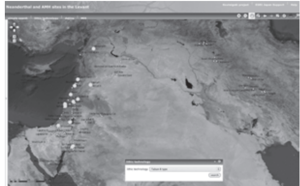
Figure 10. An example of mapping the 'replacement' sites by using ArcGIS Server.

This paper has reviewed the scheme and practical application of our Neander DB , a network-based RDBMS for Neanderthal and AMH sites in Africa and Eurasia. For a year since November 2010, approximately 3,400 layers of 1,255 sites, with more than 4,700 radiometric dates including European data published by the Stage 3 Project (van Andel and Davies 2003) and PACEA (D'Errico et al. 2011), have been recorded in the Neander DB . There is no doubt that the RDBMS with advanced network computing technologies has successfully facilitated inter-institutional collaborators to assemble and share one master database. It has contributed towards not only reducing errors and redundancies in database editing but also