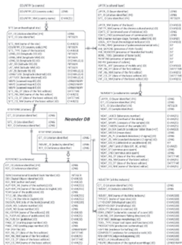
Figure 2. ER (entity-relationship) diagram of the Neander DB.

The goal of this sub-project is to visualise the spatio-temporal process of the replacement of Neanderthals by AMHs in a higher resolution than in previous projects (for example: van Andel and Davies 2003; Banks et al. 2008).