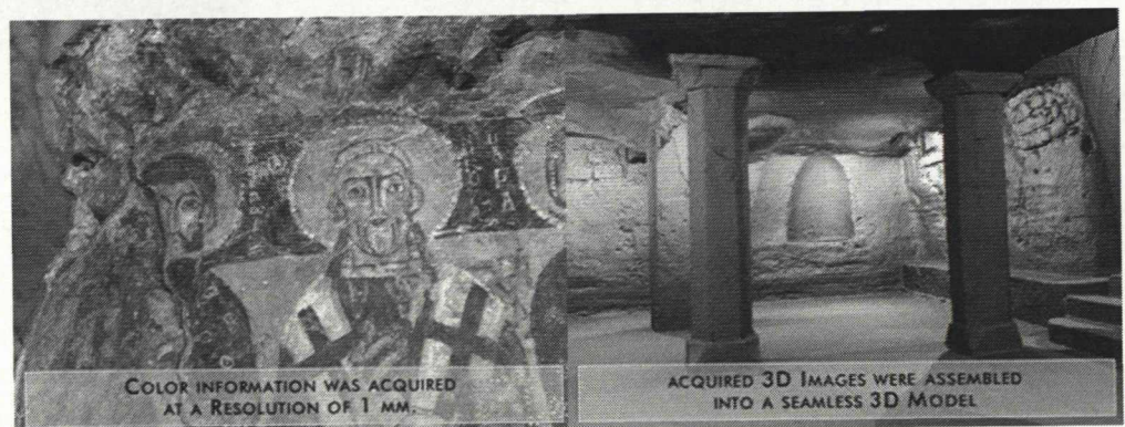
Figure 4 Movie: a) view of crypt without texture, b) view of main pillar with texture

The potential of modeling as-built reality in heritage opens-up applications such as virtual restoration or as an input to virtualized reality tours. As demonstrated with a Byzantine Crypt, a high degree of realism can be attained by those techniques and the context in which the artifacts were discovered or were used can be recreated. Real world acquisition and modeling is now possible. Technological advances are such that difficulties are