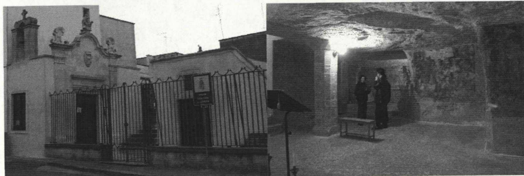
Figure 1 Byzantine Crypt, a) two outside entrances, b) interior located underground

When trying to present the history of a heritage site, the use of spa-