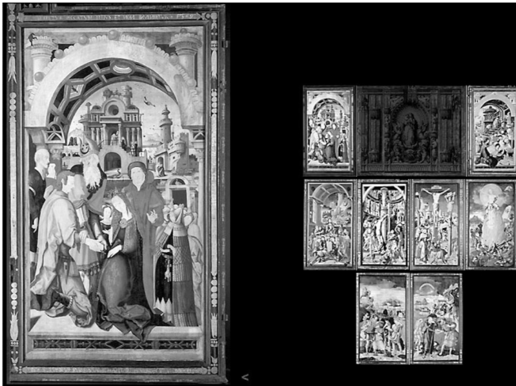
Figure 2 Homepage of the pictorial agenda of the altarpiece by Jerg Ratgeb

The CD provides multiple options to position the altar tables in relation to each other and compare them. This way an onlooker is better able to understand Jerg Ratgebs "pictorial agenda". Furthermore the CD gives one the ability to precisely observe the various pictures via a zoom function.