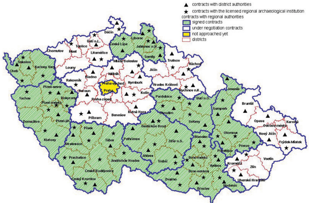
"figure2 - SAS CR - the state of contractual cooperation with the old districts and the new regional authorities and the licensed regional archaeological institutions on 10.4.2003".

and for better comfort of the users. Presently the extended database is being completed, the data are being transferred into the new structure and prepared for distribution, and user manual for the new application is under completion.