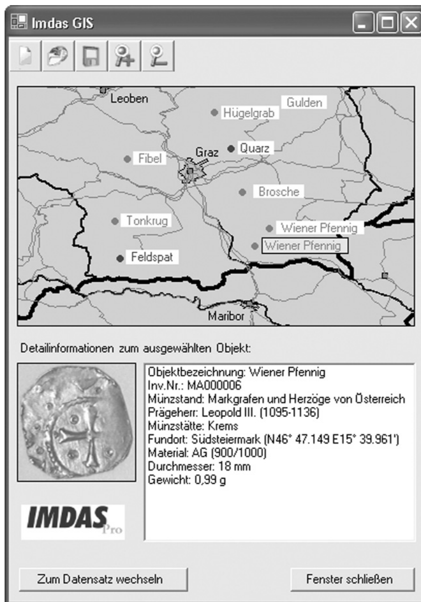
Figure 2 Screenshot of GIS component within IMDAS-Pro

IMDAS-Pro offers different components (in a service like manner) which are independent from the local documentation systems of the institutions. This concept enables a customized solution for each user and user group. However, we believe that this solution of combining already existing types of information systems into easy to use applications will lead to new type of content and collection management systems.