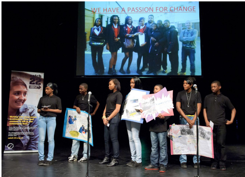
Figure 2. A team presents their ideas at the London Borough of Southwark YDAC Showcase Evening

The YDAC projects delivered in London and Bolton differ slightly from the original 2009 Greater Manchester programme, as these each involved groups of young people from a single school—so-called ‘alternative curriculum’ students. This meant that their YDAC activities were undertaken as part of their school lessons, falling under the subject area of ‘citizenship’.