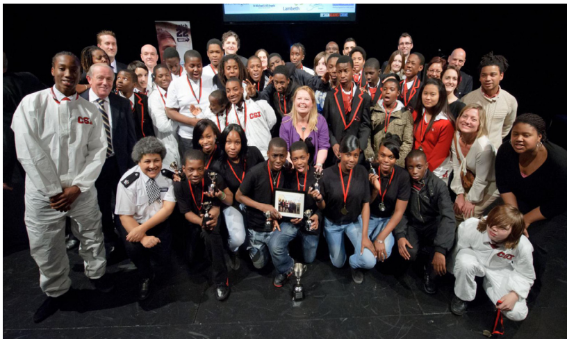
Figure 5. Young people and judges at the London Borough of Southwark YDAC Showcase Evening