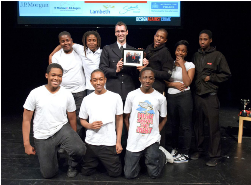
Figure 4. One of the teams with their Police Mentor at the YDAC Showcase Evening