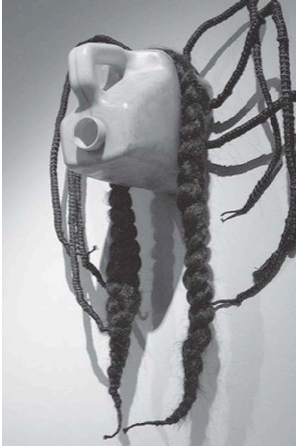
Fig. 10. A plastic can-mask by Romuald Hazoumé. Rubbish is the material he chooses to realise African objects such as masks. This is an extreme example of the self-referentiality of object displays in the elementary discourse museum. The Munich Völkerkundemuseum also exhibits such masks by Hazoumé in its African collection.

of education. Normative claims, assigned societal tasks, and economic relevance are usually located in a different discourse. But from the perspective of the term museality, the furnishing house events may be integrated into the description of modern religious subjectivity. With museality we can broach the issue of the sensorial handling of objects and of ways of moving in spaces dedicated to civilising bodies and displaying values. With this