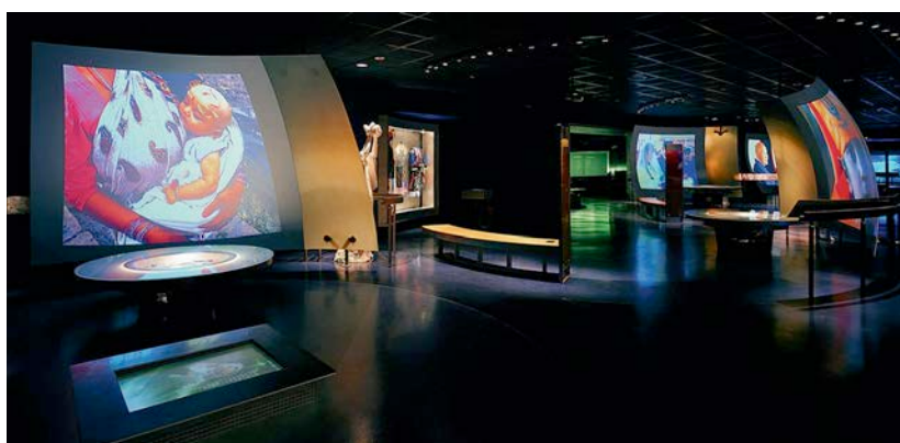
Fig. 1. The Hall of Life's Journey, media installations in the Museum of World Religions in Taipei.

The Museum of World Religions in Taipei, for instance, makes use of this device. Material artefacts are replaced by modern media such as video shows (Fig. 1). Artefacts and performances are projected into the museum space via the screen and enjoy a virtual presence without actually being there. What is shown or not shown on the screen will necessarily require