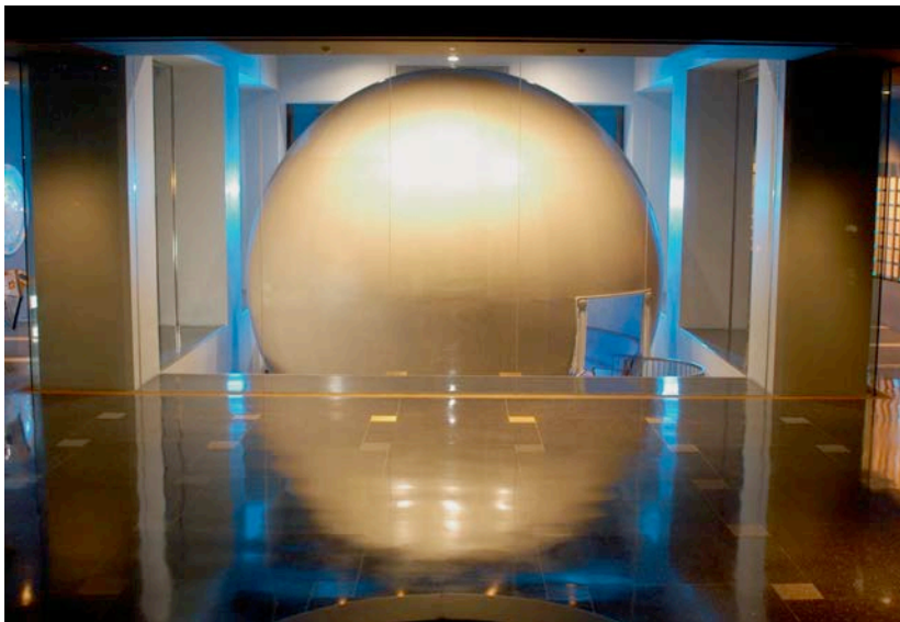
Fig. 3. Avatamsaka World in the Museum of World Religions in Taipei.

This aesthetically and financially highly ambitious project was ‘invented’ through the joint venture of a Taiwanese Buddhist master and an American architect, and financed by followers of the Buddhist founder. The intention of both the founder and the architect was to incite the visitor to become a ‘pilgrim’ travelling through the world of religions so as to share the values of tolerance, peace and love and to ‘feel’ the Avatamsaka Buddhist message “all in one, one in all” (Fig. 3). The arrangement seeks to communicate the ‘common core’ of all religions and to create an imaginary space to relate to, where visitors can act and react. The ritual suggestions and multimedia installations are highly symbolic and sophisticated, with almost no explanation of the symbols’ meaning. The Buddhist founder’s hope was to contribute to interreligious understanding by speaking directly to the “heart” and the senses. The sponsors, however, did not appreciate the sophisticated design and the US architect’s minimalist abstract symbolism. They were disappointed not to find more of their own traditions (Buddhism and Taiwanese popular religions) and familiar things to relate to. A new director therefore popularised the museum by changing some of the original design and making it more ‘museum-like’, in order to fulfil