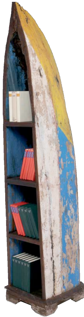
Fig. 8. A “boat-bow bookshelf.” These bookshelves have been flooding European living rooms for some years and replace the comparatively harmless little bamboo variations of the colonial style. The bookshelf is advertised as being made of original Balinese boat bows. This is a typical secondary construction with a long past of transcultural flow during which museums have played a crucial role. Museality as a concept may grasp these pathways of circulation through societal domains. The crucial question is whether the powerfulness of this part of the boat is ‘forgotten’ or ‘lost’ or whether it is incorporated in the lifestyle culture - or framed more generally: what is the aim of displaying this object? (Source as Fig. 7)