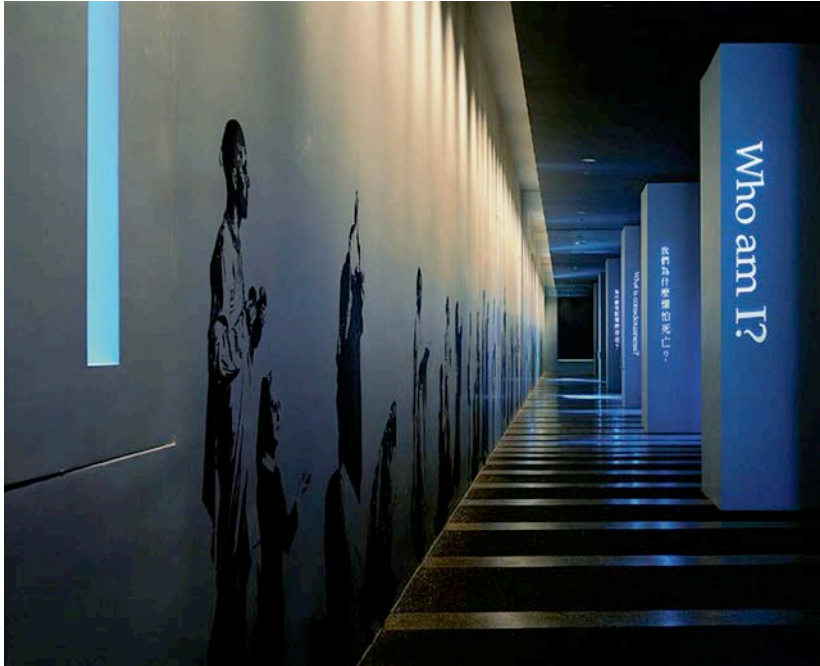
Fig. 5. The “Pilgrims’ Way” in the Museum of World Religions , Taipei. It leads into the main exhibition area of the museum, thus inviting the visitor to conceptualise his visit in the museum as a pilgrimage towards religious enlightenment rather than a purely intellectual exercise. Light arrangements, rough and glazed floor stones, and audio-texts from the off medially enhance this participatory approach in the museum. (Wilke & Guggenmos, Im Netz des Indra , 32–41)

generates an existential context. 12 From this it follows that religious objects, when placed behind glass in museum exhibitions, or arranged and put together in a necessarily new and artificial way which is abstracted from everyday religion (even when rebuilding an altar, for instance), are perceived differently, perhaps more emotionally, or more reverently, than everyday objects.