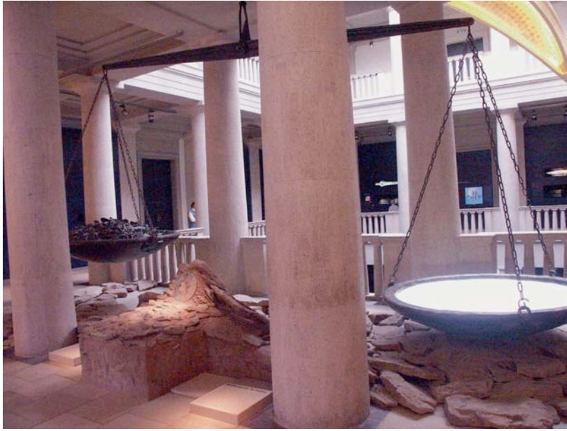
Fig. 6. Set of scales in the exhibition “Der geschmiedete Himmel” (“The Forged Sky”) in the Landesmuseum für Vorgeschichte Sachsen-Anhalt in Halle, Germany, 15 October 2004—22 May 2005. This exhibition, which was centred on the sky disc of Nebra, used monumental visual imagery to transport the supposedly religious content of early Bronze Age findings concerned with the seasonal movements of the sun. The scales suggest that the bronze objects were offerings to the gods in return for life-giving sunlight.

made familiar with the Bronze Age while being simultaneously assured of her/his different, that is modern and progressive, identity.