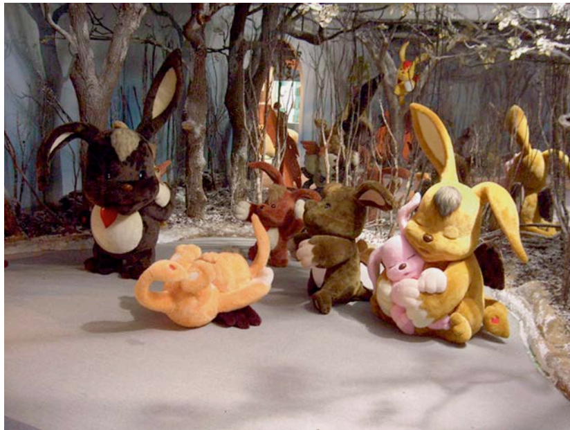
Fig. 4. Kids' Land in the Museum of World Religions .

This example on the one hand illustrates the high degree to which social environment and economy play a significant role within museal discourses.