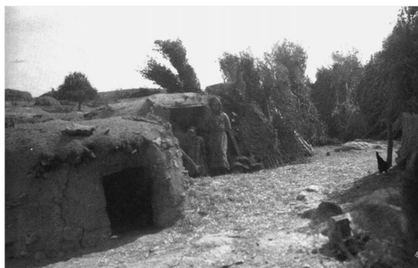
Fig. 2.6.1.3. and 2.6.1.4. Loam huts in el-Meğdel/Magdala 18