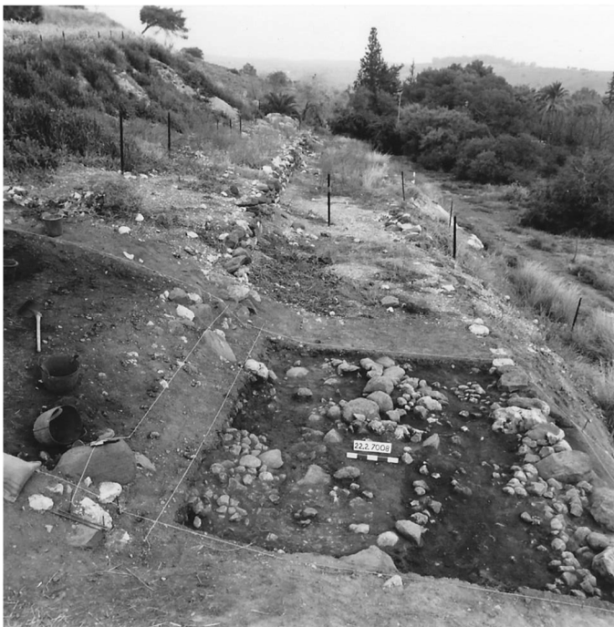
Fig. 2.6.1.1. This photo taken towards the northeast shows square CF 11/12a in the center and square CE 11/12a on the left side. It was taken in the very beginning of the excavations, and it clearly demonstrates the step-like structure of the landscape in the lower part of Field I. On the right side, on a lower elevation, is the modern service road of Mekorot. Behind the trees on the very right edge of the photo is a bluff down to the Sea of Galilee. In the foreground is L. 4003 (basket 7008) where the Mameluke/Ottoman road was found.

Area U: BS 9, BS 10, BS 11, BT 9, BT 10, BU 7, BU 8, BU 9, BU 10, BU 11, CE 10.